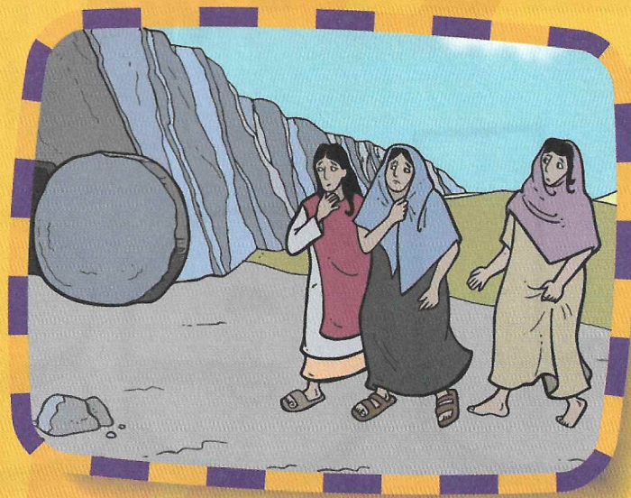
His friends went to visit the tomb.

Three days later, three ladies met an angel.