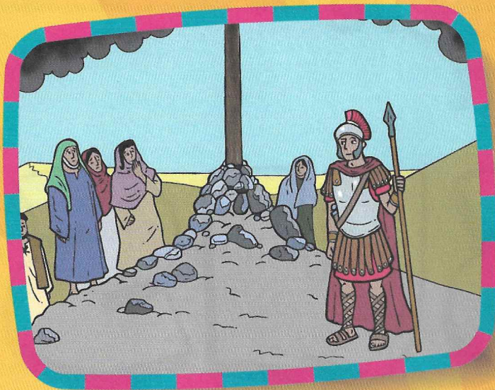
Jesus died on a cross.

This Bible story comes from Mark 15:21–16:8